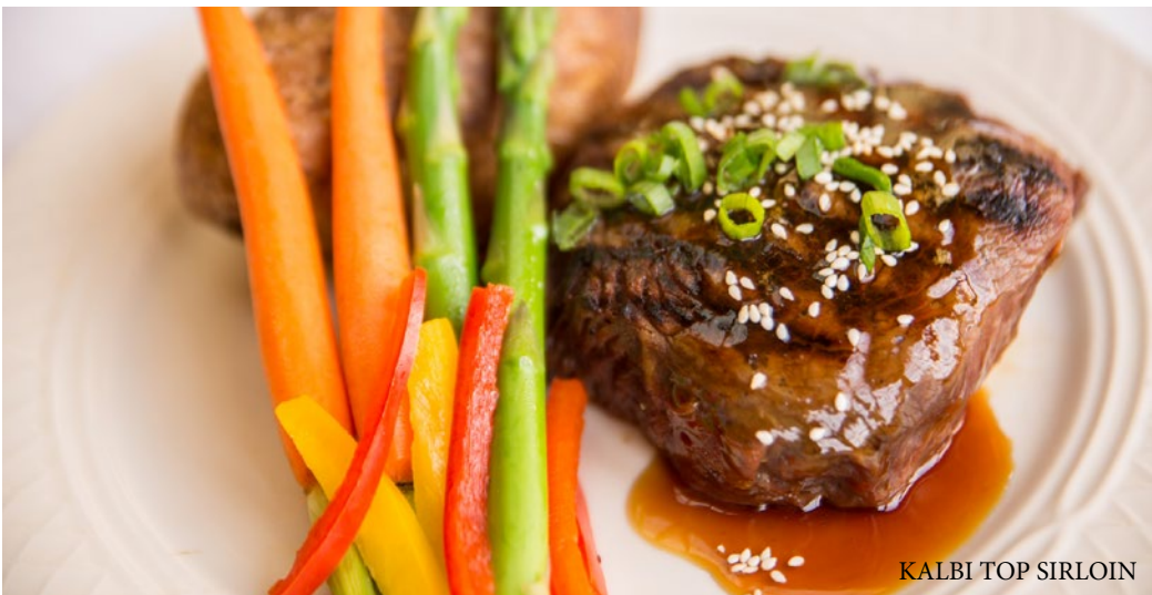
KALBI TOP SIRLOIN