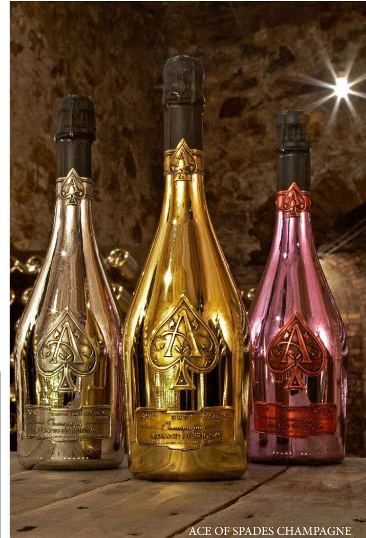
ACE OF SPADES CHAMPAGNE

Dance Floors (Wood & White) Chair Covers with Sash & Overlay Premium Chairs (Chiavari & Wood) Color Linen or Floor Length Tablecloths Audio Visual Equipment Colorful Room Uplighting