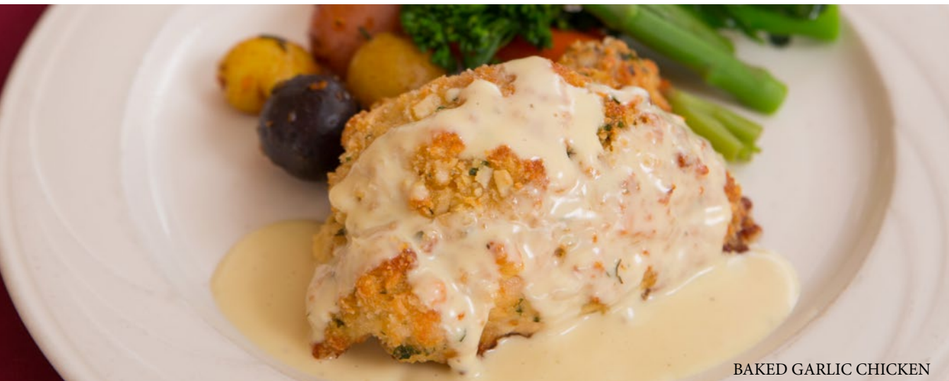
BAKED GARLIC CHICKEN