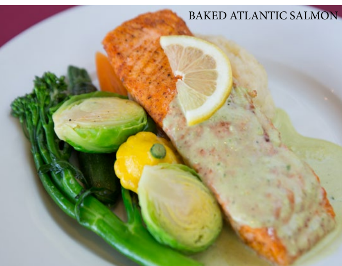
BAKED ATLANTIC SALMON

Entrées Include: Salad Selection, Chef's Selection of Accompaniments & Seasonal Vegetables, Oven Fresh Sourdough Rolls & Butter, Dessert Selection, Starbucks Coffee + Decaf & Iced Tea