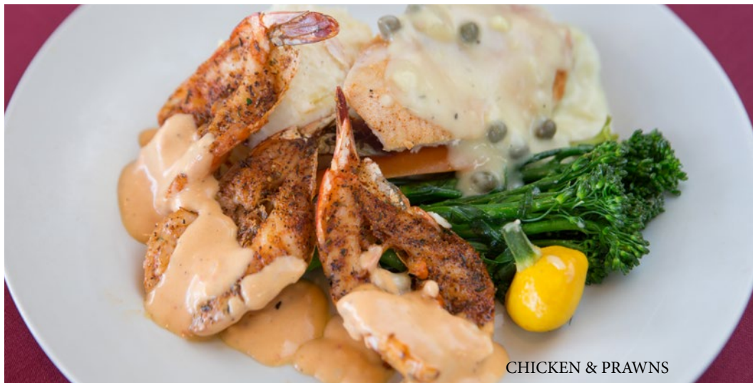
CHICKEN & PRAWNS