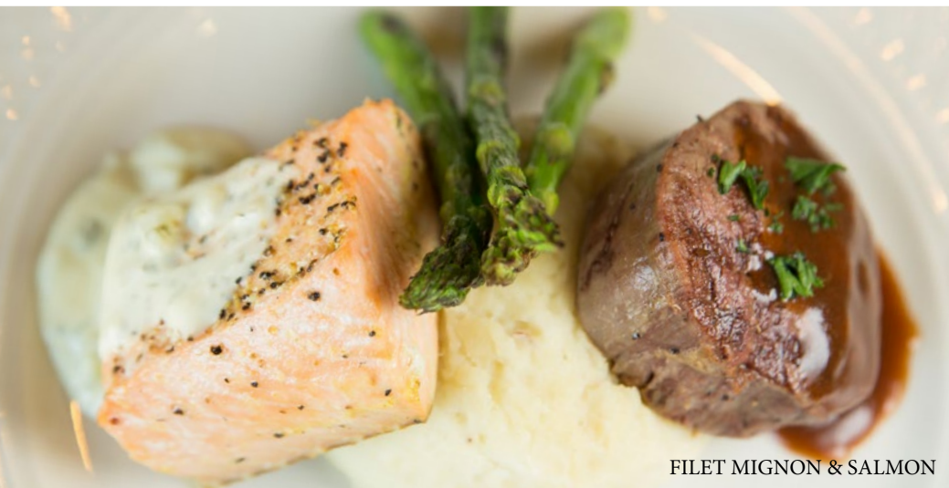
FILET MIGNON & SALMON