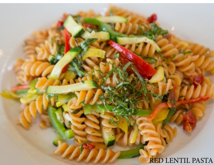
RED LENTIL PASTA

Halibut, Shrimp, Mahi-Mahi, Sea Bass, Swordfish, or Lobster Also Available at Current Market Price